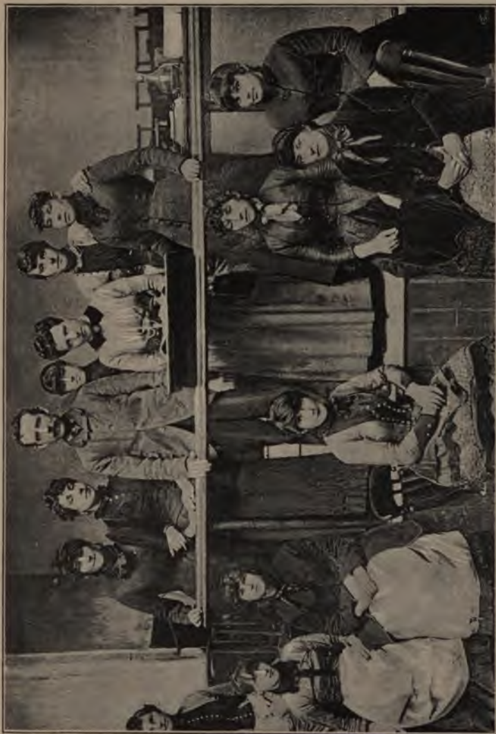
STRIKE COMMITTEE OF THE MATCHMAKERS' UNION.